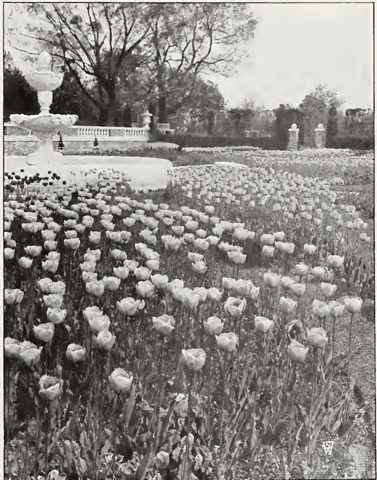
A Dutch Bulb Garden—Darwin Tulips, one variety to each of the various and pleasingly shaped beds

Louise de la Valliere. Brilliant cherry-rose with pale blue base starred white. A very clear and beautiful color. Height 24 inches. 3 50 25 00